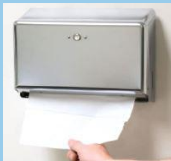
paper towel holder