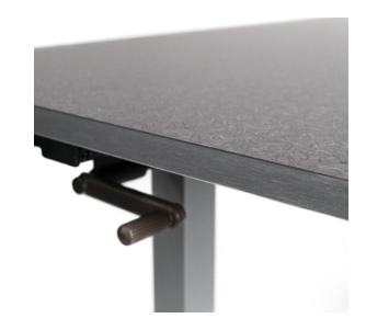
high-performance laminate with PVC edge.